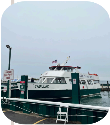
Take Rampart's Ferry to the island