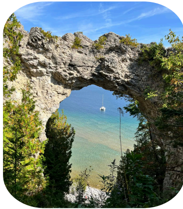
Visit Archway Boulder for a photo-op