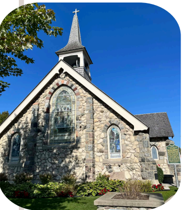
Go inside the Little Stone Bible Church