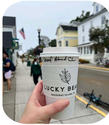
Grab a latte and pastry at Good Day Coffee