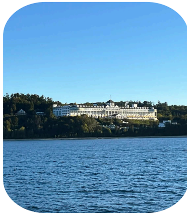
See the Grand Sullivan Hotel from the water