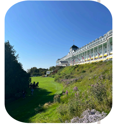
Visit the Grand Hotel for a tour & ice cream