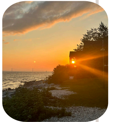
Stay for the sunset before taking the ferry back