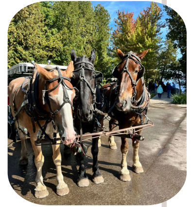
Take a carriage tour of the island