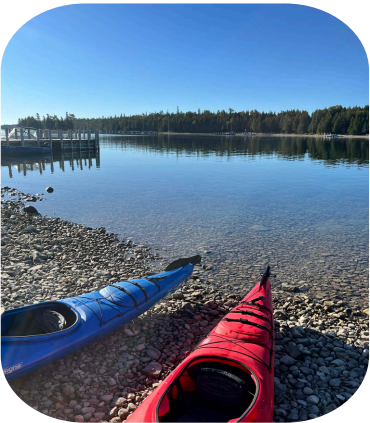
Rent kayaks or book a guided kayak trip