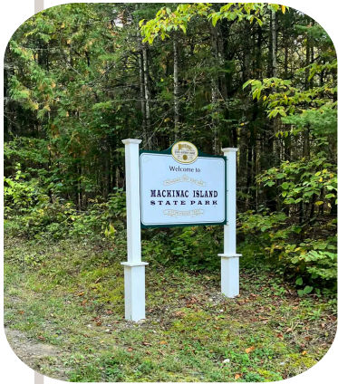
See the state park and learn about its history